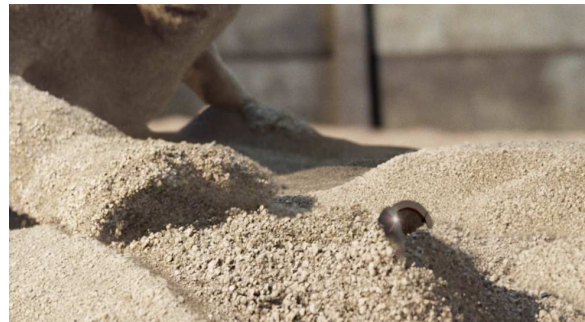
Figure 2: Sandman’s hand collapses. This shot was fully CG.

In addition to animating the Sandman character, animators added hand-animated “skirts” showing how the sand piled up around Sandman as he pushed moved around (see Figure 1a). We began by converting these animations into heightfields via ray casting, and then into a difference format, where we stored the difference from the current frame of the heightfield to the previous frame. We then ran temporal and spatial filters over these differences, and added successive differences in order to play back the animation. The heightfield was then eroded using the method of [Onoue and Nishita 2003] to generate a shape that looked more like sand (see Figure